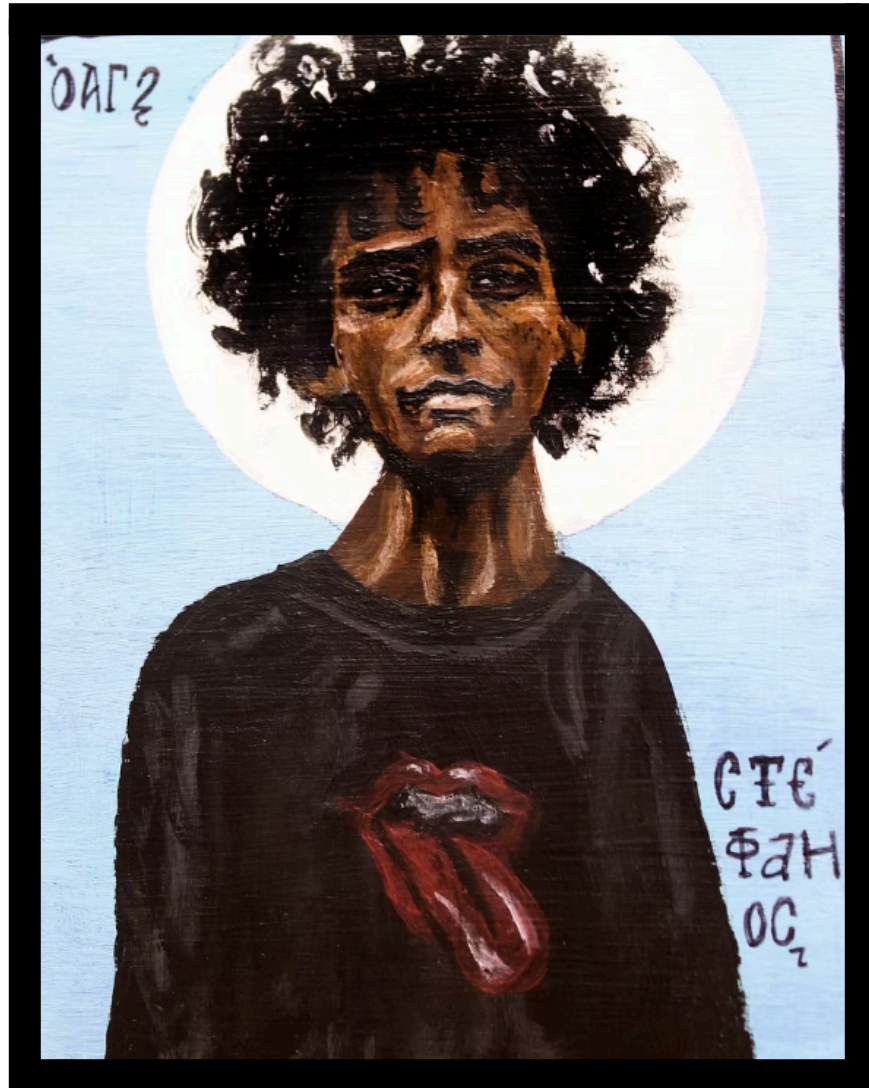
Image: Image: St .Stephen by Gracie Morbitzer