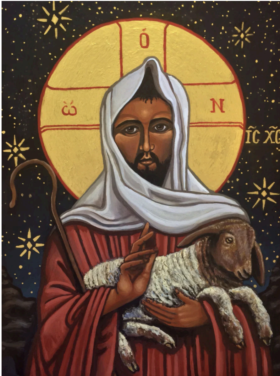
Image: "The Good Shepherd" by Kelly Latimore. (more on this image on back cover)