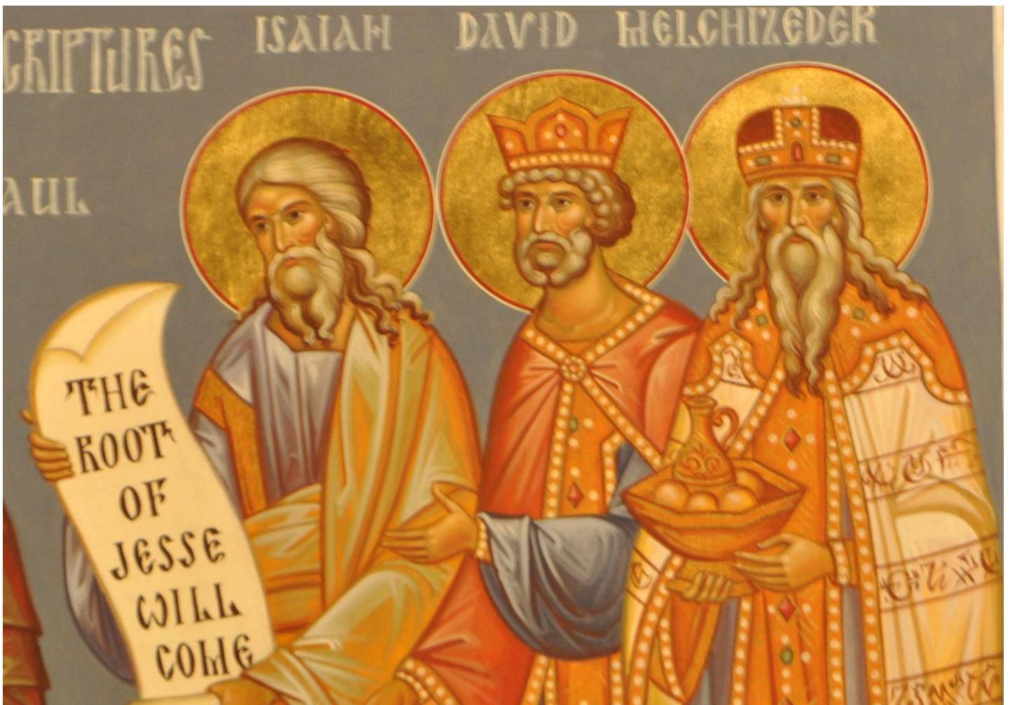
Image: Icon: Isaiah, David, Melchizedek, by bobosh_t on Flickr. CC BY-SA 2.0