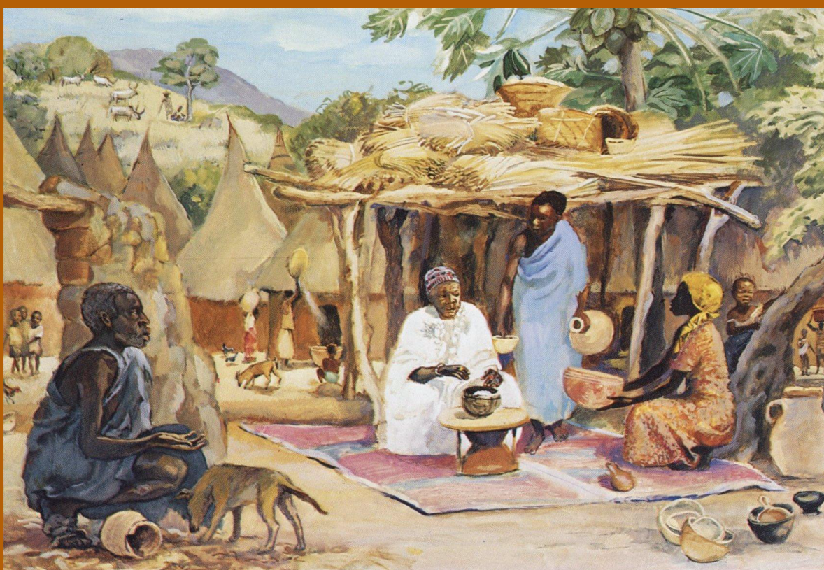
Picture: The Rich Man and Lazarus , by JESUS MAFA https://diglib.library.vanderbilt.edu/act-imagelink.pl?RC=48267

Pentecost + 16 / Creationtide 5 September 28, 2025 4pm