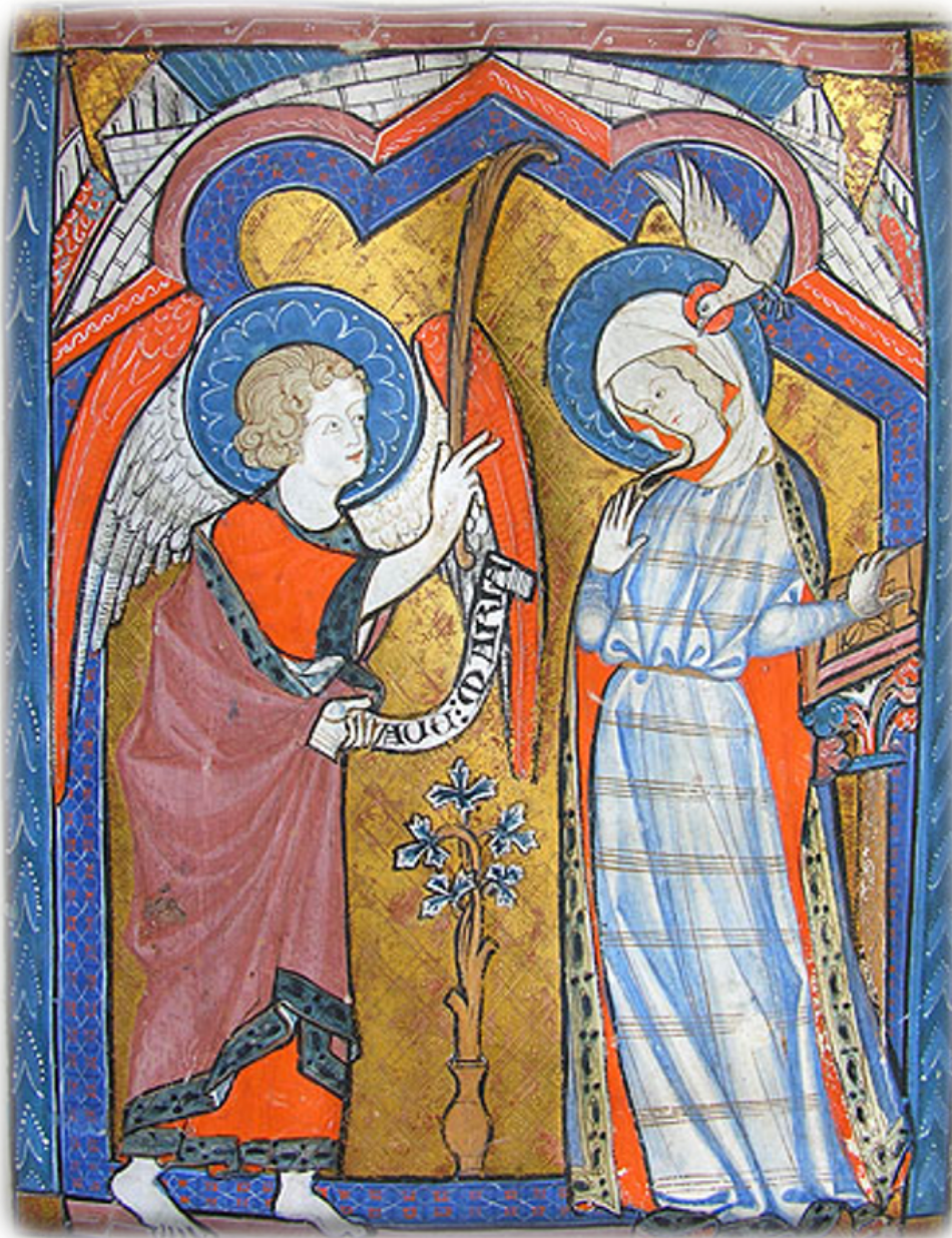
Image: 14th-century Annunciation scene A description from the '1992 Disciple's Prayer Book' by the Anglican Council of Indigenous Peoples:

"St. Ephrem said that Mary conceived Jesus by "Her ear." We also see Jesus become flesh among us through hearing the Gospel. This book is a pastoral adaptation of the Book of Common Prayer to help disciples hear the Gospel and see Jesus.