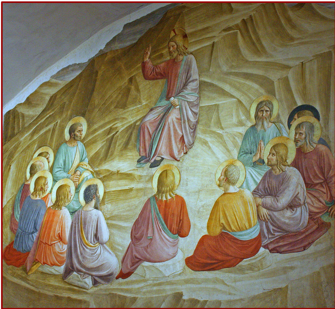
Fra Angelico (c. 1400-1455 CE). San Marco, Florence.