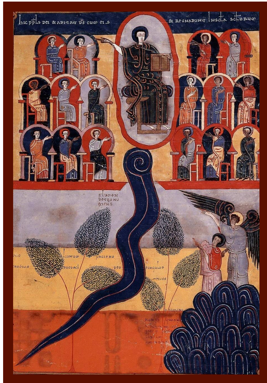
The New Jerusalem and the River of Life (Apocalypse XII), Beatus de Facundus, 1047