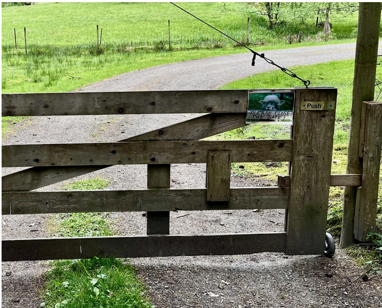
Sheep Gate - Hunterston Farm, Galiano Island