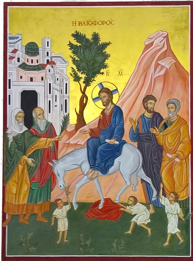
Entrance to Jerusalem - Byzantine Icon