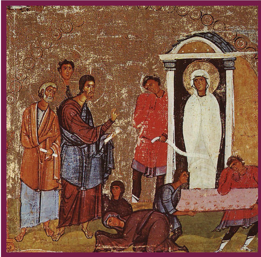
Traditional Ikon: The Resurrection of Lazarus