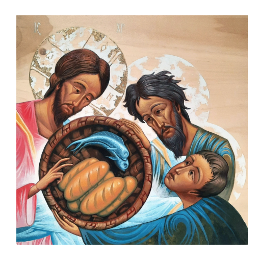
https://www.annapolozicons.com/ - support the artist

We now have a treasure chest at the back of the church for collection. Thanks for any help you can be in this amazing work!