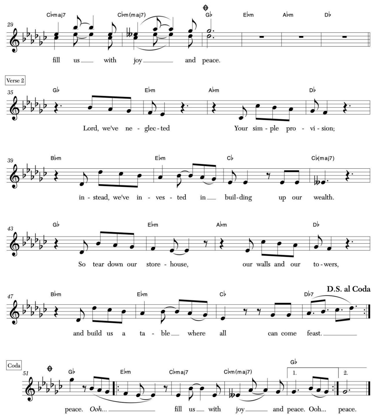
Alattlas / Zach / Morton (Porter's Gate Publishing) / CCLI# 7198240