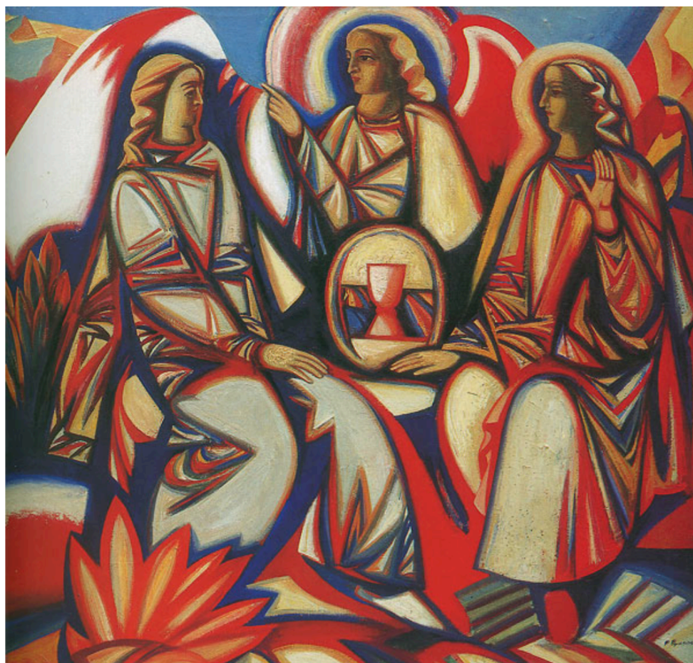
Feodosiy Humeniuk - The Trinity

It's open to all who wish to join in-person or online.