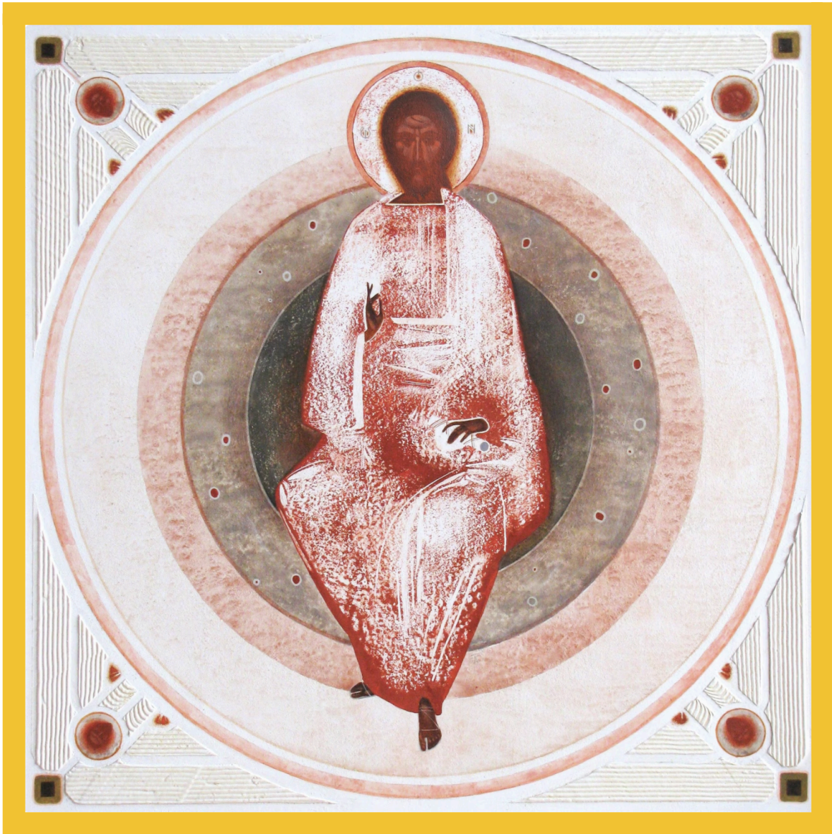
Image: The Ascension by Ivanka Demchuk - Lviv, Ukraine - support the artist- https://en.ivankademchuk.com