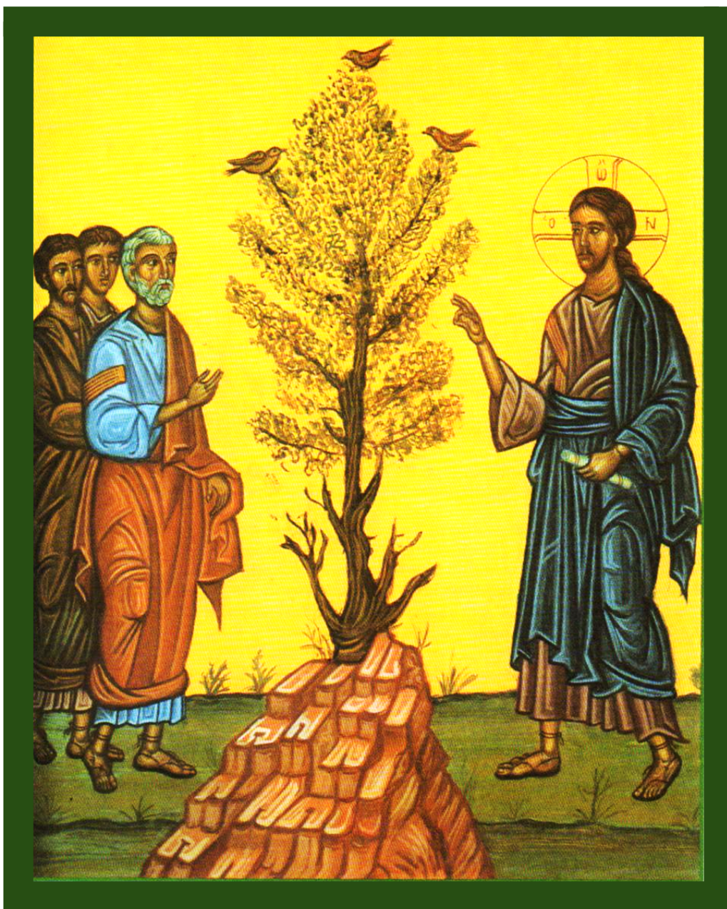
Image: Ikon of the Mustard Seed Parable