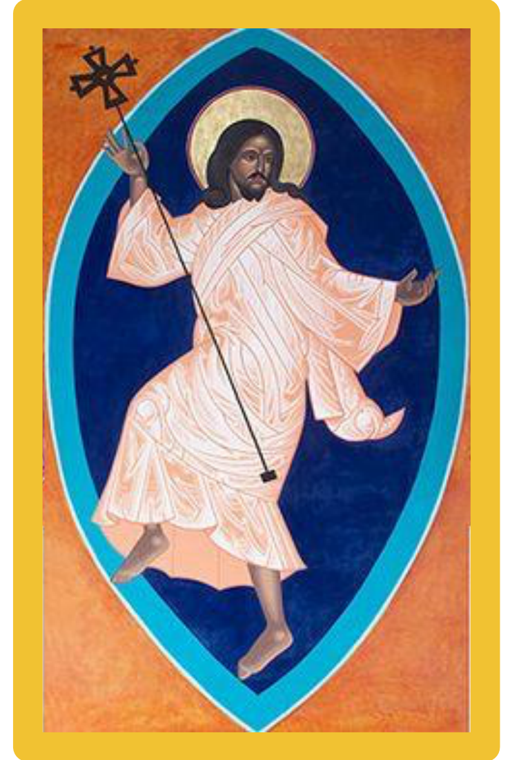
Image: Detail from Dancing Saints - St. Gregory of Nyssa Church ,San Francisco