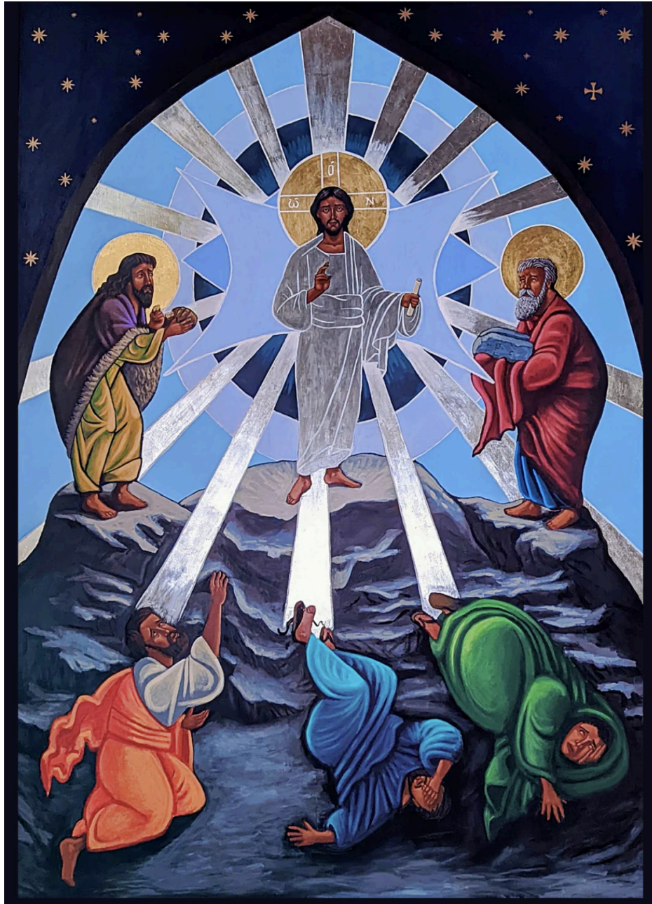
Transfiguration by Kelly Latimore