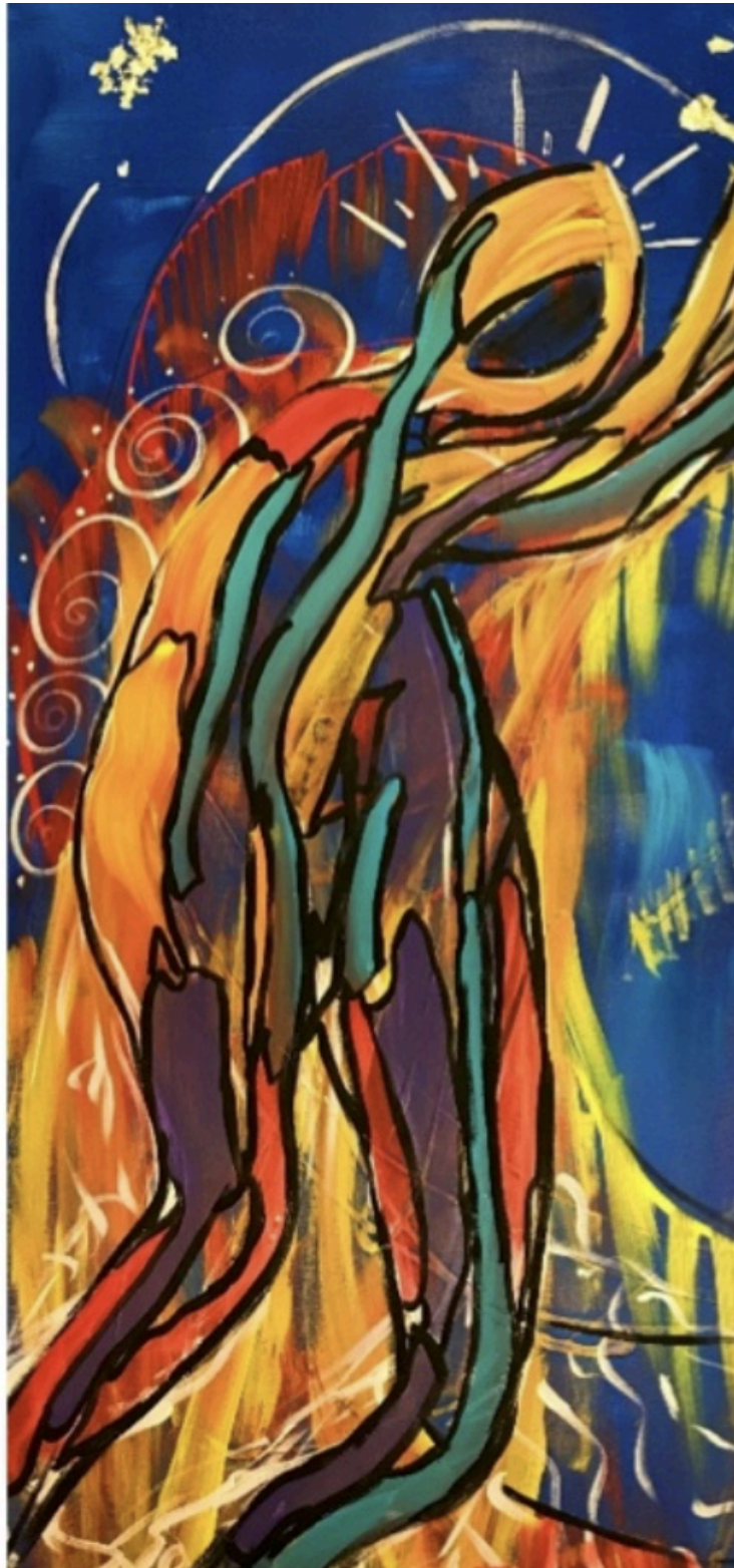
Image: Carmelle Beaugelin "The Composer" Movements of Grace, 2019.

admin@abbeychurch.ca + www.abbeychurch.ca 778.557.4166 We would love to connect.