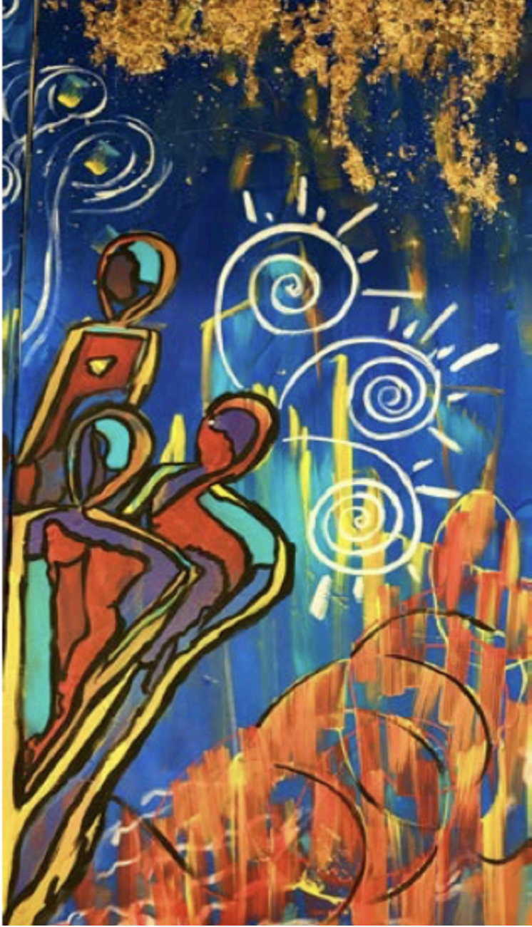
Image: Carmelle Beaugelin "The Orchestral Summons" Movements of Grace, 2019.