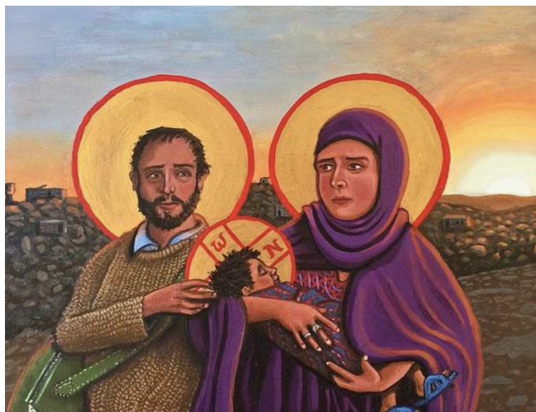
Kelly Latimore Icons

We believe that Christ's love binds our differences together and renews our hope as we gather each week at Jesus' table of radical welcome.