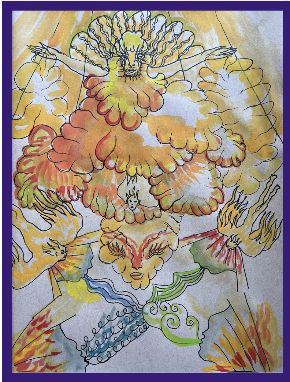
Image: "Cloud of Knowing" by Charlotte Walton + AbbeyChurch Advent Artist-in-Residence