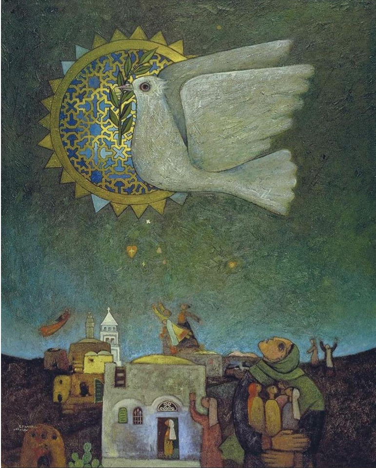
image: Hope by Sliman Mansour, Palestinian Artist.