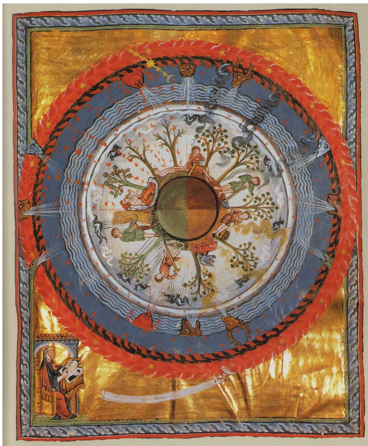
Image: St. Hildegard of Bingen