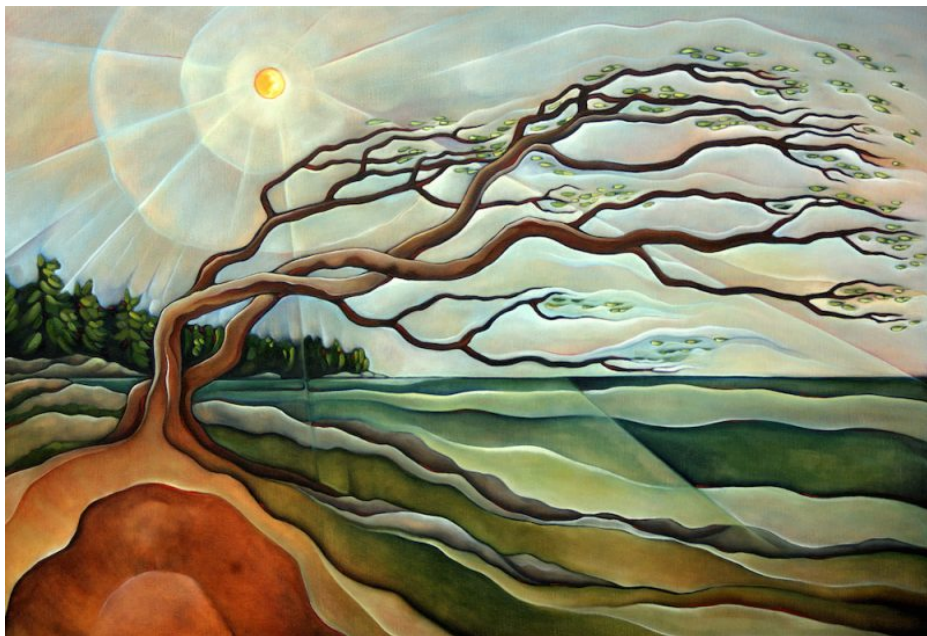
Arbutus - Caitlin Ambery