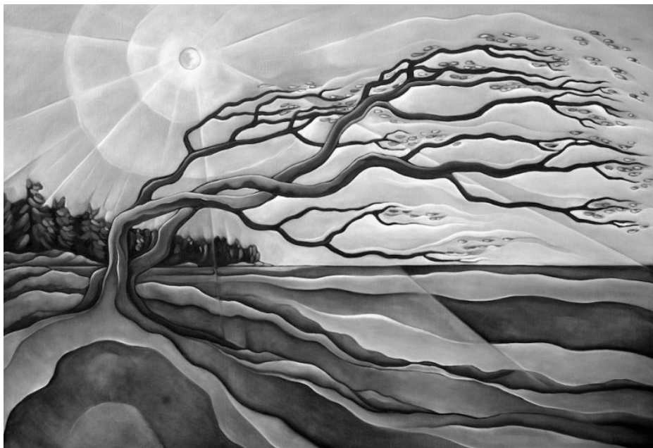
Arbutus - Caitlin Ambery