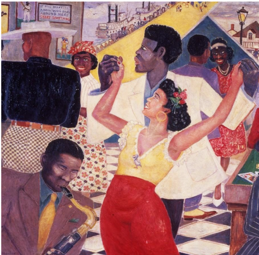
Beale Street Blues, 1943, Palmer Hayden from the collection of the Museum of African American Art.