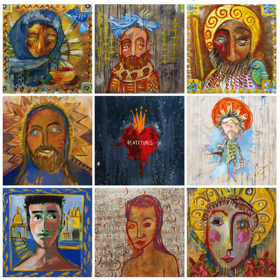
The Beatitudes Project Art by Cory Basil and Jimmy Abegg