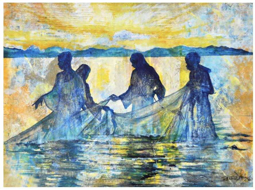
Fishers of Men - Rex R. Deloney

"My artwork is focused on storytelling, symbolism, and spirituality. My goal is to reach the you, the viewer emotionally and spiritually by creatively using color to awaken perceptual triggers in your memory. I like to employ visually thick words, phrases, or quotes to create imagery symbolizing the hopes, dreams, and struggles of the African American Culture."