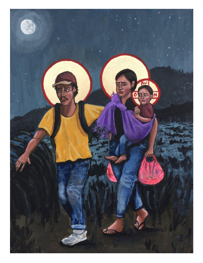
Refugees: La Sagrada Familia - Kelly Latimore Icons