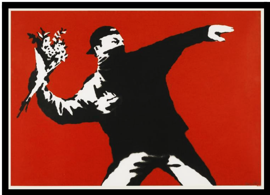
Love is In the Air - Banksy