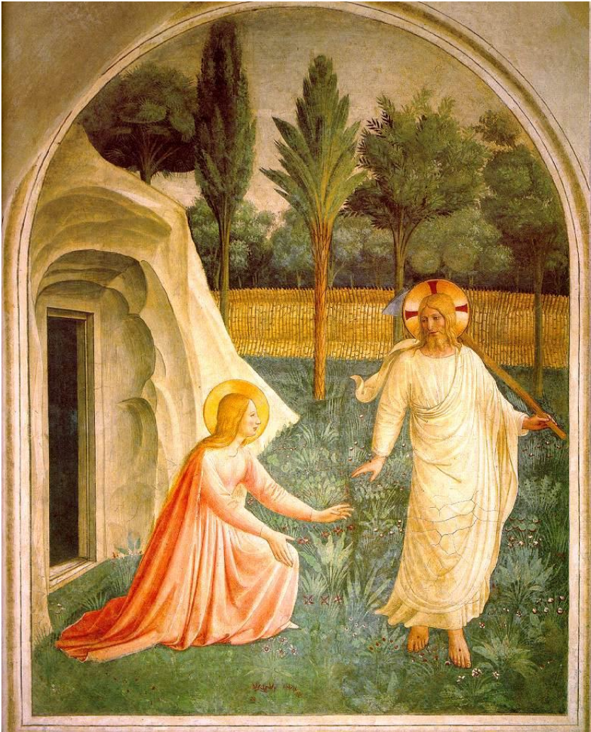
Image: Fra Angelico, Noli me tangere , 1439-1443, fresco, Monastery of San Marco, Florence.